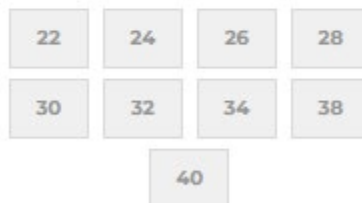
RISE Sandies Blueprint Poly Jammer